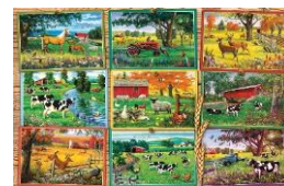
Cobble Hill 1000 piece Postcards from the Farm