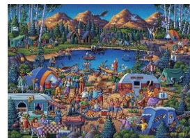
Dowdle 1000 piece Camping Adventure

https://www.facebook.com/groups/SpeedPuzzling/