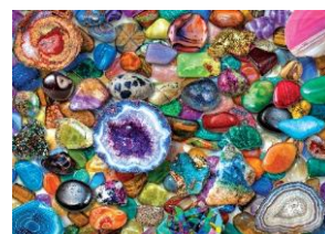
Peter Pauper Press 1000 piece Crystals and Gemstones

(Virtual Jigsaw Puzzle Contest--teams of 4)